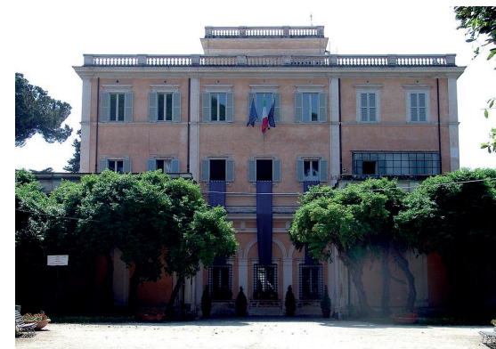
Palazzetto Mattei, Villa Celimontana Via della Navicella, 12, Rome 13-15 December 2023

Sensors and biosensors as strategic tools for diagnostics, food safety, and environmental monitoring